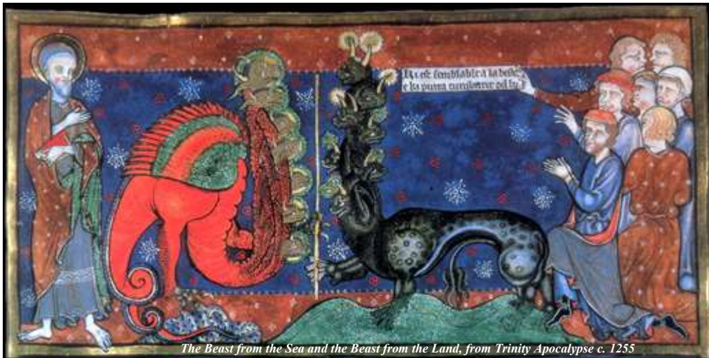
The Beast from the Sea and the Beast from the Land, from Trinity Apocalypse c. 1255

11 Then I saw another beast coming up out of the earth, and it had two horns like a lamb and spoke like a dragon. 12 And it exercises all the authority of the first beast in its presence, and causes the earth and those who dwell in it to worship the first beast, whose mortal injury was healed. . . . 16 And it causes all, both small and great, rich and poor, free and slave, to receive from it a mark on their right hand and on their foreheads, 17 so that no one can