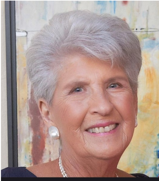
3/6/1937 – 6/15/2023