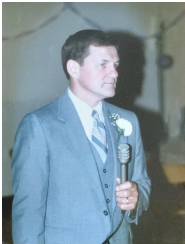
8/9/1938 – 2/24/2023