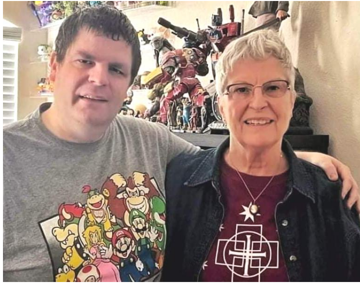
5/5/1984 – 11/11/2021